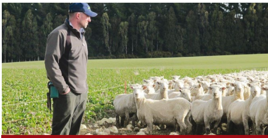
Motu-nui South ewes on swedes at Braxton Station, Northern Southland.

For progress and price increases in the future we must go down this track. We're told co-operatives are the best for our assured future but does Fonterra's recent performance give you confidence?