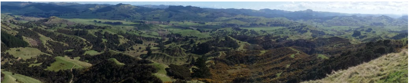
Panorama of ICA Station, Spring 2014.