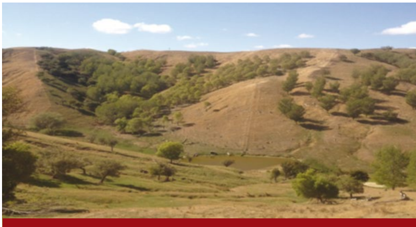
Extensive planting on Pakaraka allowed us to utilise poplar and willow through the summer – providing feed for hungry ewes and slowly increasing effective area.

This year we've retained the progeny of the F1 TefRom to