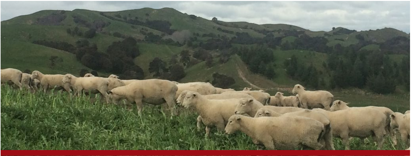
Romney ram hoggets on rape crop, August 2015.